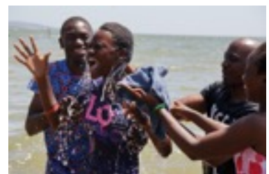
Baptism - 2017