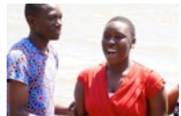
Baptism - 2017