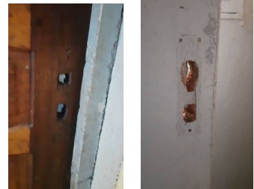
Missing Door Locks