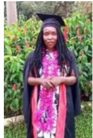
Our Graduate! 2019